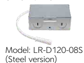
Model: LR-D120-08S (Steel version)