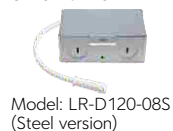
Model: LR-D120-08S (Steel version)