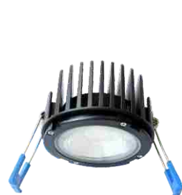
4" module downlight