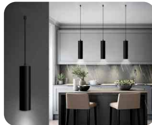
Zero profile, elegant look

Approved Location*-please contact our sales for outdoor application Warranty*-refer to Hi-Bright warranty policy