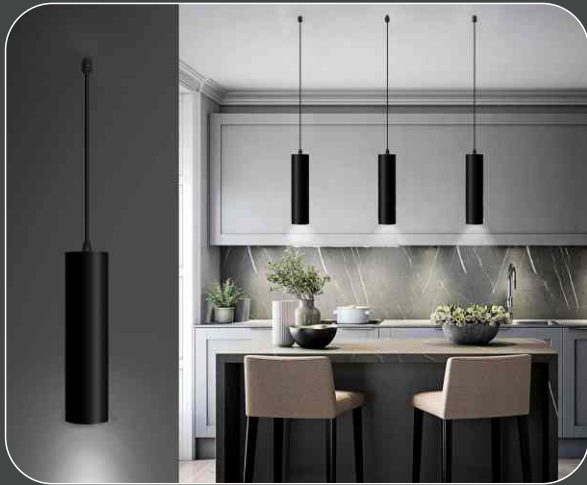
Zero profile, elegant look