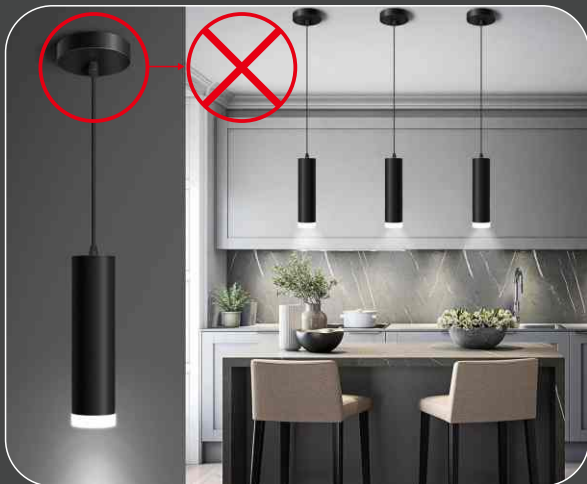
Pendant anchor is conspicuous as the the height is too thick